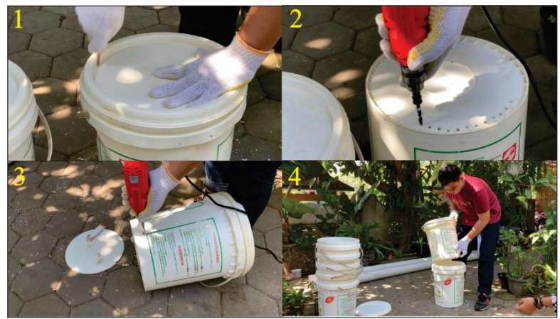
Figure 3. The stages of making Tong Kompas

Counseling and practice of making Tong Kompas was carried out with members of Kompaster Gestari and residents of Dusun Gesikan. Activities are still carried out face-to-face while still prioritizing the Covid-19 health protocol, which requires participants to wear masks, keep their distance, wash their hands, and be carried out in open spaces. The activity begins by explaining directly the importance of processing household organic waste. Household organic waste processing needs to be done. Besides helping to reduce the generation of organic waste, it can also help the process of fertilizing resident's plants in their homes. So far, their household organic waste is only piled up and only a small part is used for animal feed. Then the residents were shown the form of stacked buckets that had been prepared previously. In general, making a Tong Kompas consists of 4 stages (Figure 3), namely: (1) cutting the bottom of the bucket; (2) Hollow out in a circle all over the bottom surface of the top bucket; (3) Install the faucet for the LOF output in the lower bucket; and (4) Stacking the top and bottom buckets into a Tong Kompas. The Tong Kompas can accommodate up to 20 liters of Liquid Organic Fertilizer.